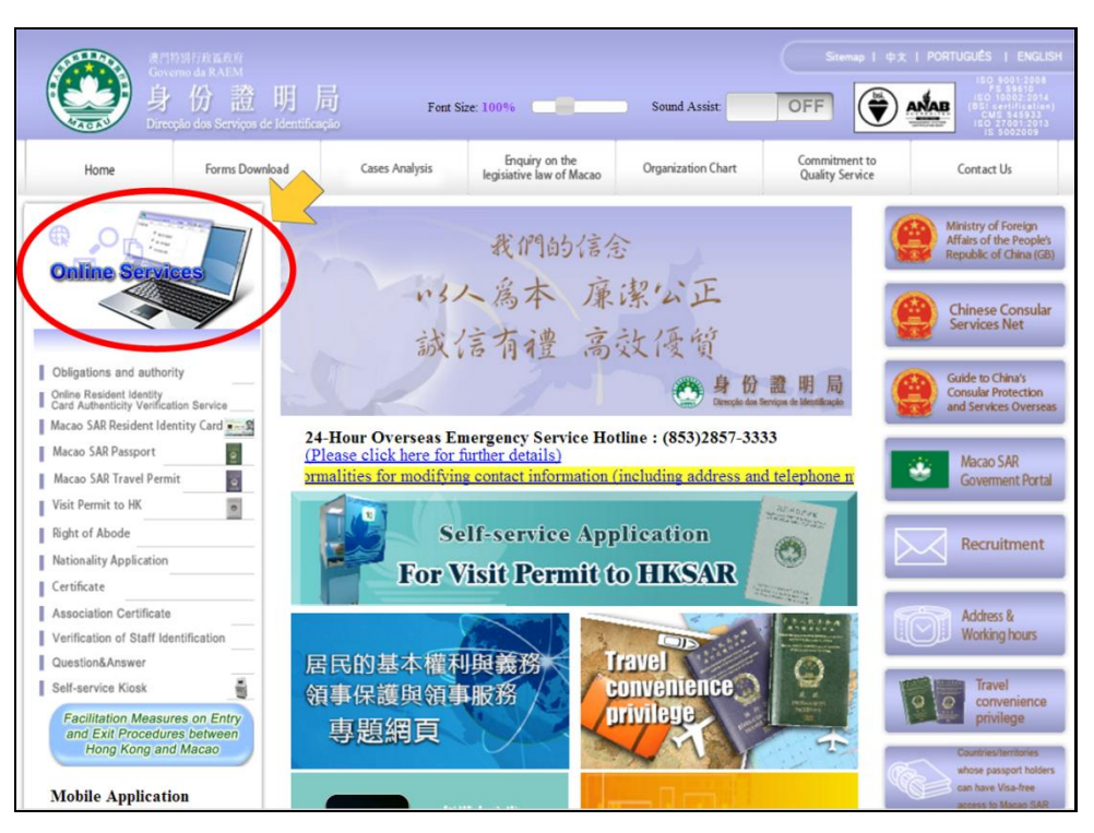
DSI's "Online Services" zone

Later, DSI will introduce online application service for the Certificate of Association, and will continue to provide Macao residents with more diversified electronic services to enhance service quality.